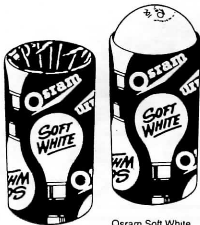
Osram Soft White